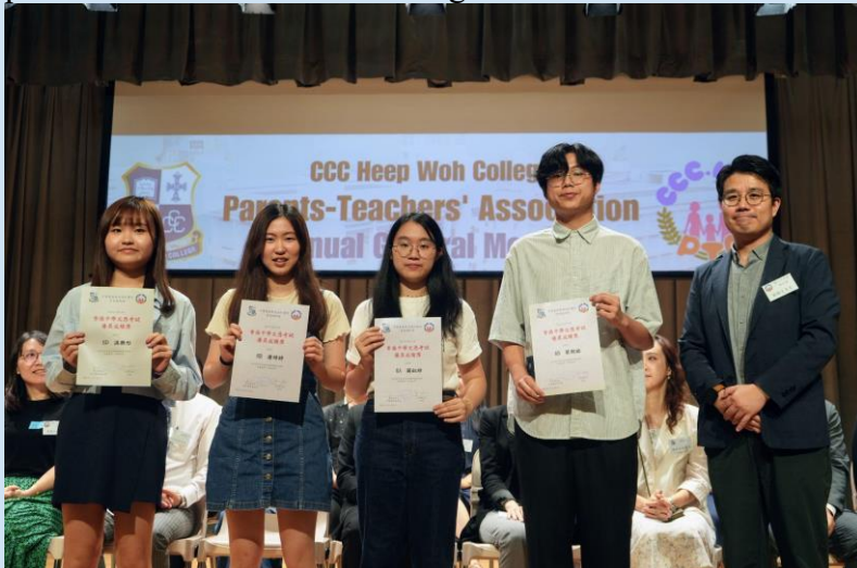
Pic: Awardees of HWC PTA The Best Results in DSE Award (HKDSE 2024)

18/10 The 24 th Annual General Meeting of the PTA, a subject selection talk for S3 students and parents as well as class teachers' meetings for other forms were held. Approximately six hundred parents attended the Parents' Night.